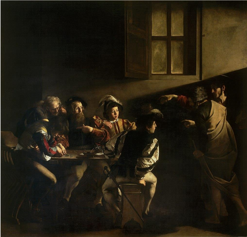
"The Calling of Matthew"- Caravaggio (1599)