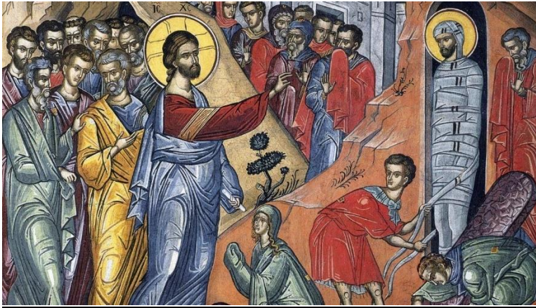
Lazarus Saturday - Youtube