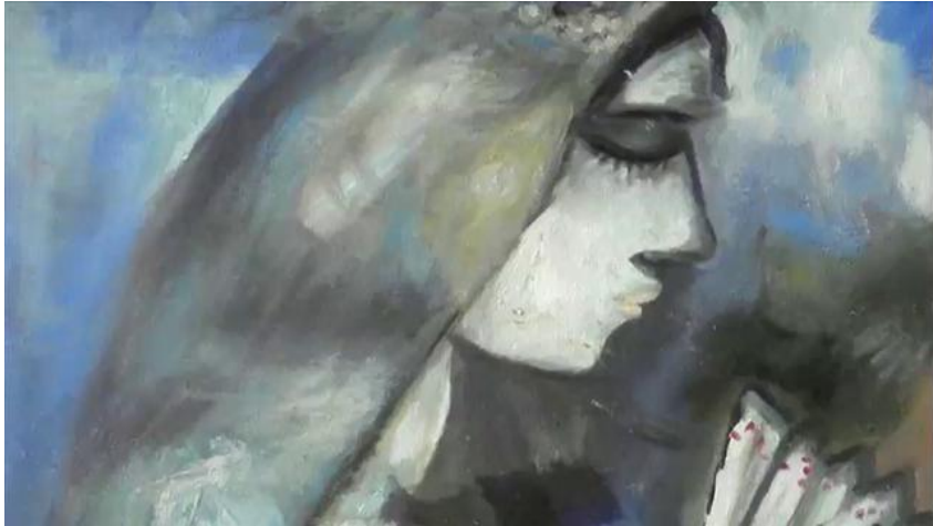
The Persistent Widow – La Viuda Persistente / Art by Parabelproject.nl