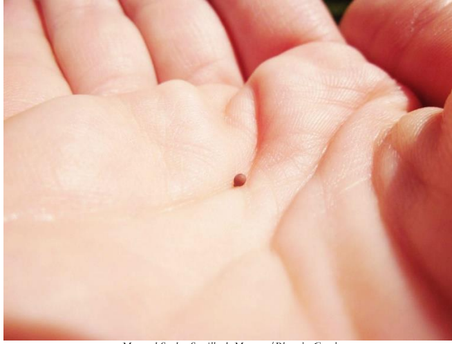
Mustard Seed – Semilla de Mostaza