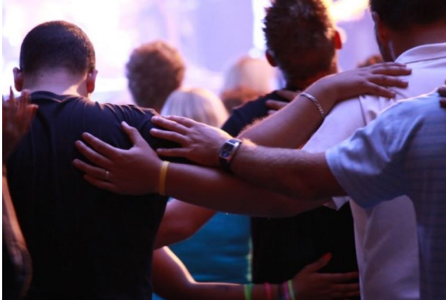
"That they may all be one..." John 17:21 / "Te pido que todos ellos estén unidos..." Juan 17:21