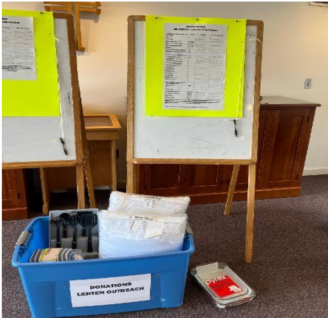
Lenten Outreach Donations