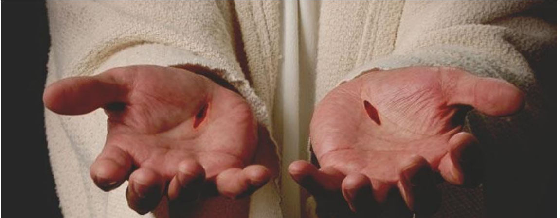
Wounds On His Hands / Heridas En Sus Manos