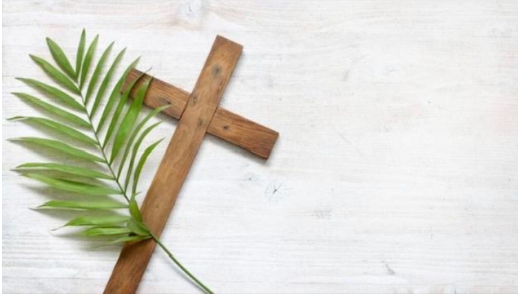
Palm and Cross / Cruz y Palma