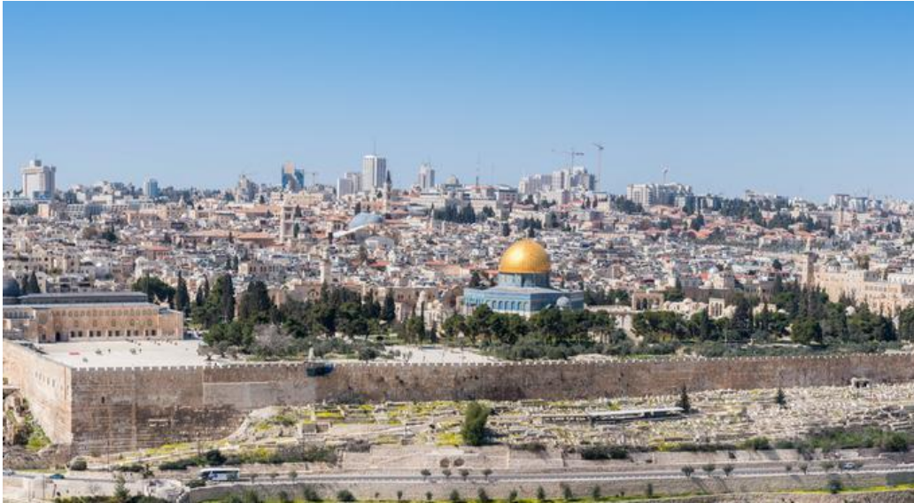
View of City of Jerusalem / Vista de la ciudad de Jerusalem.