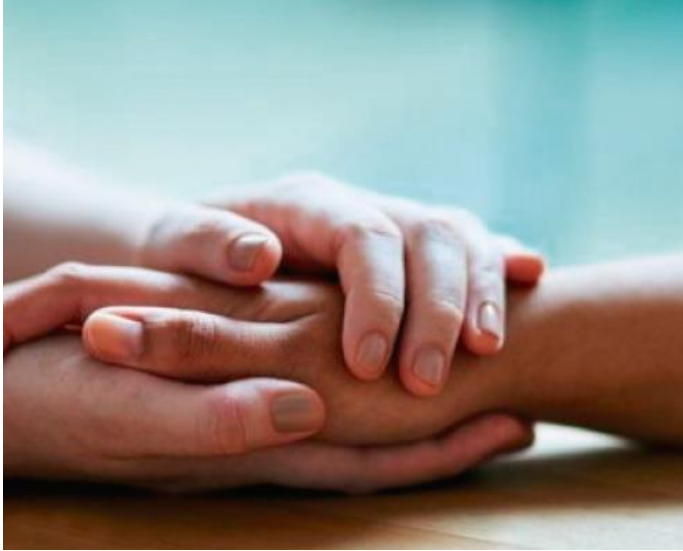
Called To Be Merciful / Llamados a Ser Misericordiosos – Credits: Anónimo