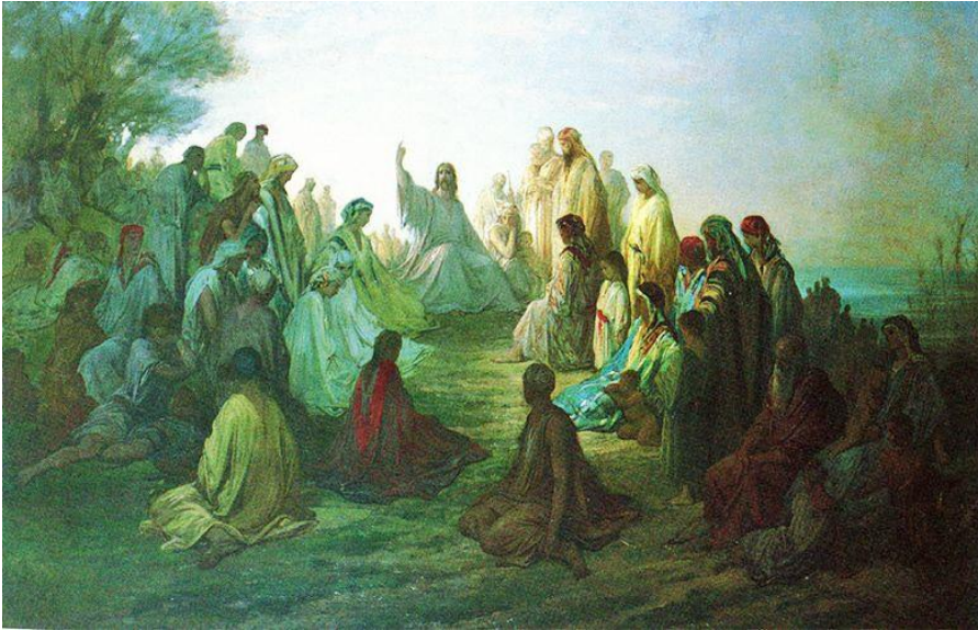
Blessings and Woes / El Sermon del Monte