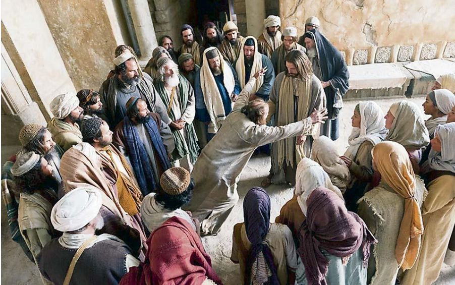
Jesus in the synagogue of Capernaum / Jesús en la sinagoga de Cafarnaím – Credits: Google (Ecos de la Palabra)