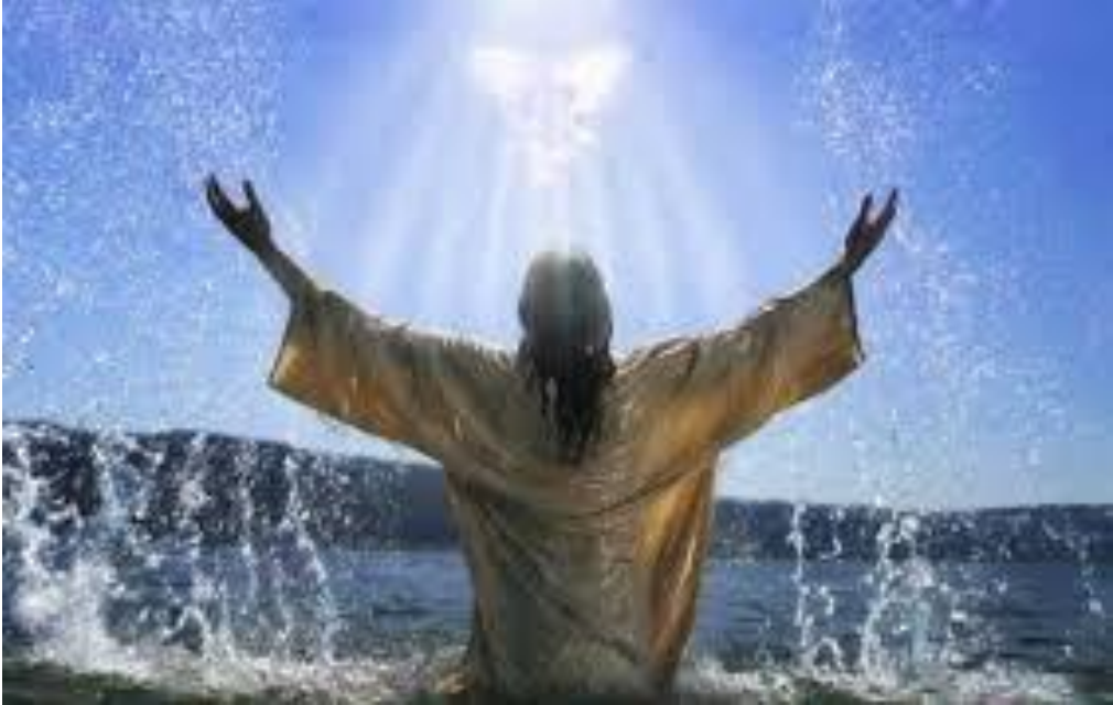
This is my beloved Son / Este es mi Hijo amado