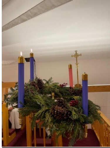
Advent Wreath / Corona de Adviento – Photo by Vidai Genovez-Andres