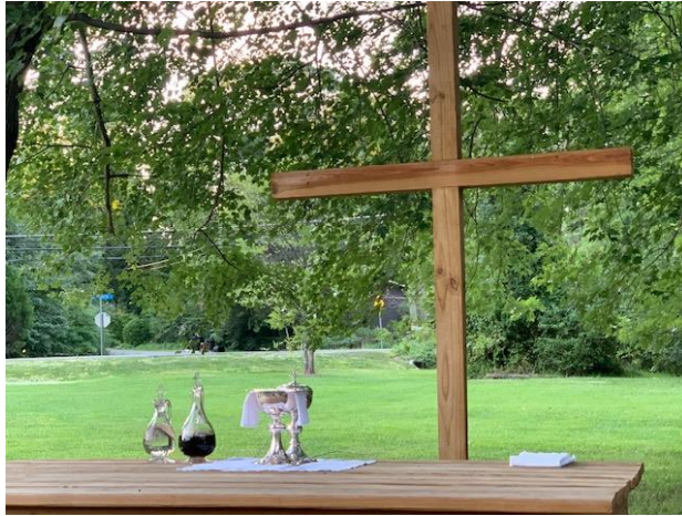
Outdoor Chapel / Capilla al Aire Libre by Vidai Genovez-Andrés