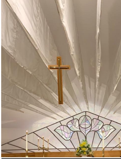
Altar / Altar