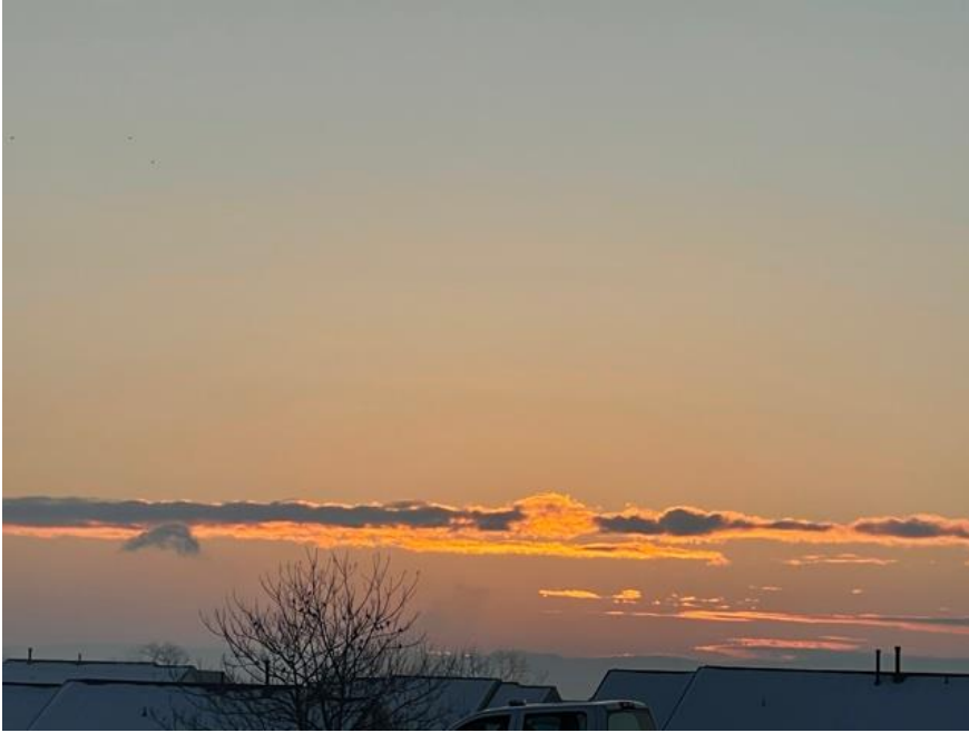
Sunrise over Loudoun County / Amanecer sobre Loudoun County