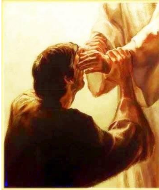
Bartimaeus, The blind man / El ciego Bartimeo