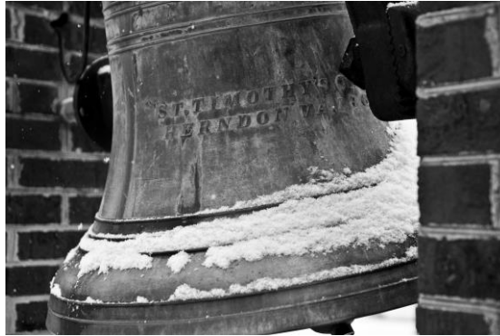
Snow Covered Church Bell