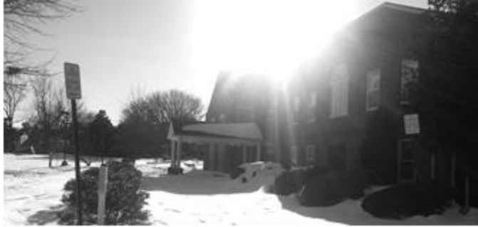
Pre-School Entrance Snowed In