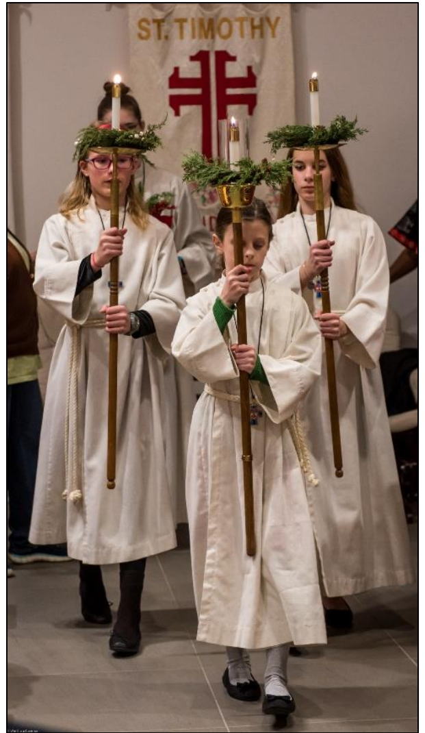
Christmas Eve at St. Timothy's