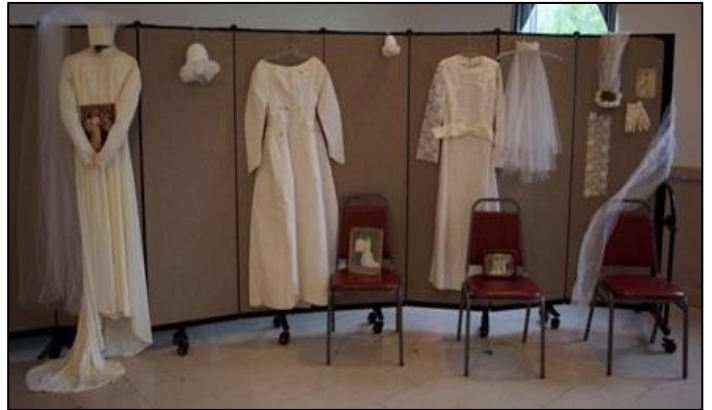
Vintage wedding gowns on display