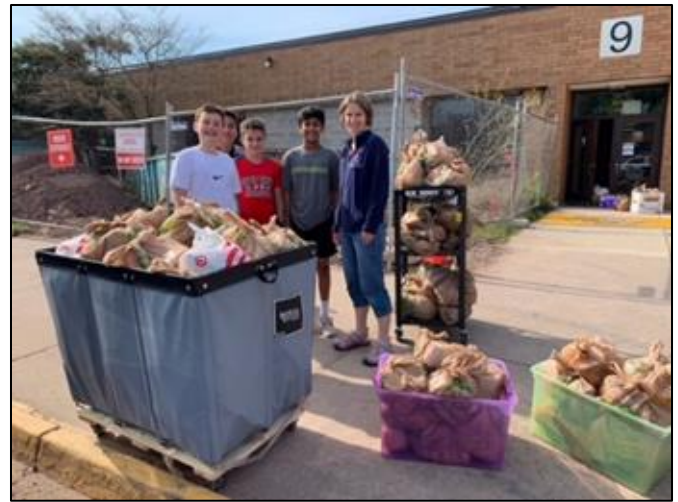
Clearview Elementary School students help unload donations

One in six children in America doesn't have enough to eat. That includes more than 23,000 in Fairfax County. This Lent, St. Timothy's congregation stood together and said "We can do something to help..." and we did! In five weeks, we packed and donated more than 350 backpack meals to Clearview Elementary School for students in need to take home over spring break. As a reference point, that was two full van loads, stuffed to the gills!