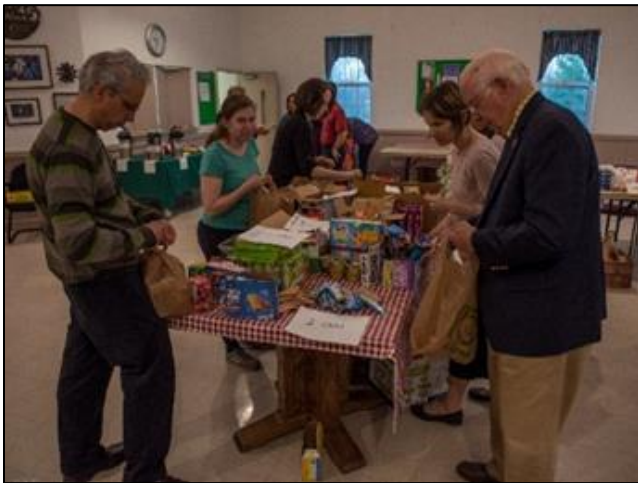
Parishioners pack food in Henry Hall

Thanks to all of your generous food and monetary contributions and time spent sorting food, packing meals, and carrying boxes, we were able to more than double our original goal! It was an incredible team effort, with parishioners from all services and all ages involved in packing and making cards. Our success would not have been possible without all of your support and help. Thank you.