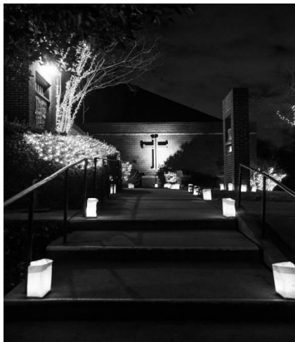
Craig Dubishar – Photographer