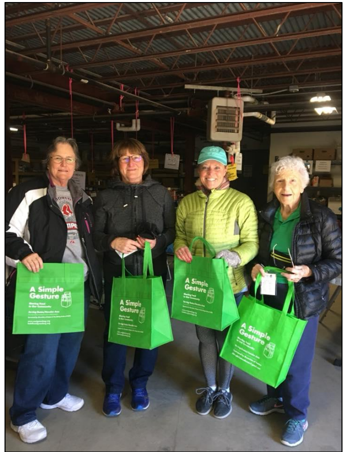
LINK volunteers assisting with the Holiday Program