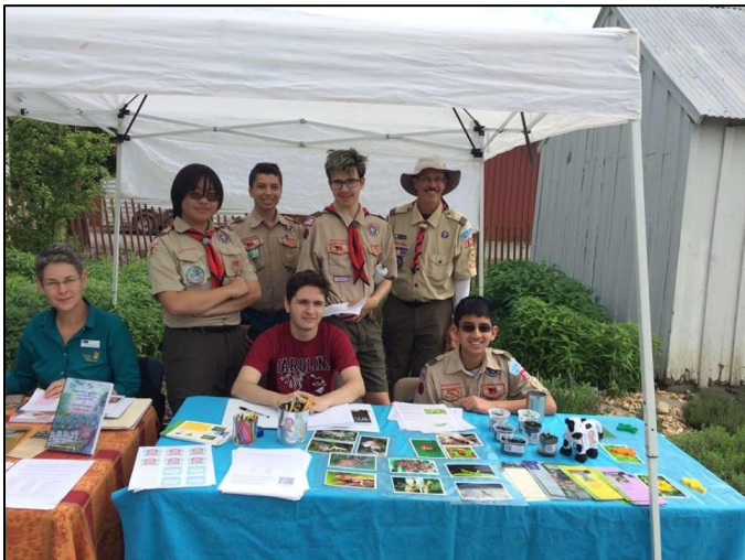
Our volunteers at the event. Thank you to everyone who came out to help!

If you went to Frying Pan Farm Park for their Spring Farm Day on May 12, you might have seen Troop 159 present at one of the tables there! Our table was about invasive plants, which are a pressing environmental issue in Fairfax County. Through the entire event, we got 186 visitors- and it's surprising that many of them didn't know the extent of this problem. Foreign plants and animals that invade native forests may seem like a foreign concept as well, but these invaders can actually be found in your own backyard! While we had plenty of activities and handouts for the kids (sticker and word searches galore!) we were also able to spread the word about the invasive plant cleanups happening at the park in August under the IMA program.