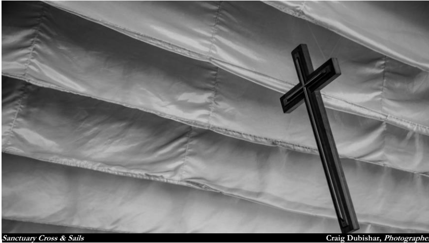
Sanctuary Cross & Sails