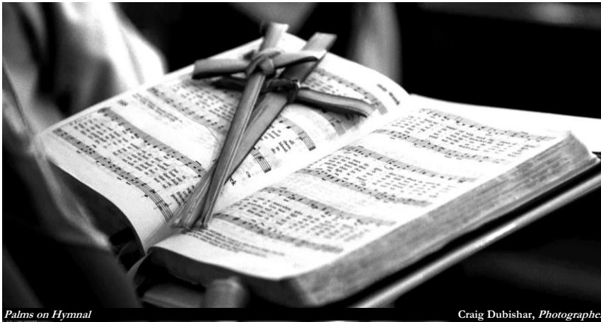
Palms on Hymnal