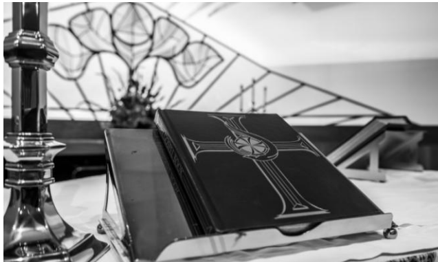
The Gospel Book